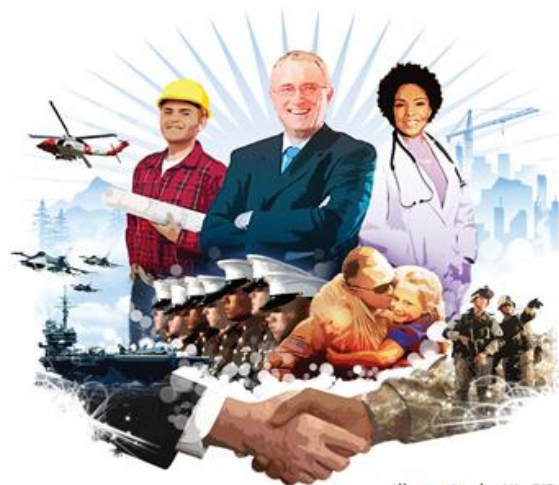
Illustration by Nic DiPalma

Meet with high quality employers ready to hire. Applicants participating in training seminars receive priority access to the job fair. View participating employers.